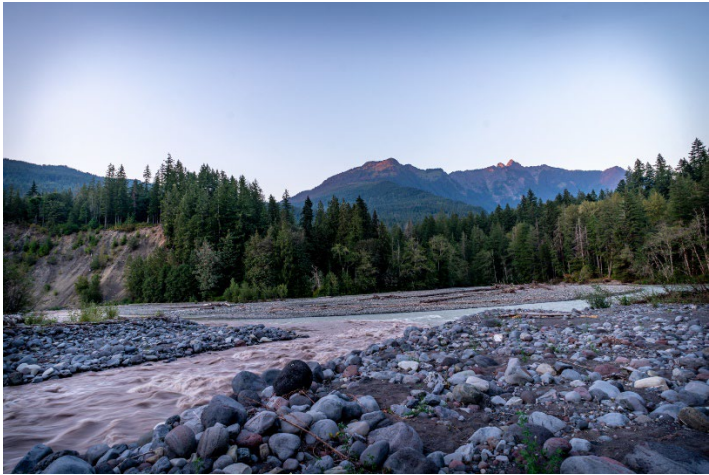
Taken from Glacier Creek, last sunset light over Church Mountain.