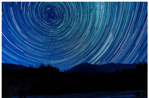
Taken from Glacier Creek, star trail over Church Mountain, combining 498 pictures.

Have a talent or skill you'd like to donate to the community as a committee member? We'd love your help! We're currently looking for members interested in helping with website development. Email info@snowlinecc.com to learn more.